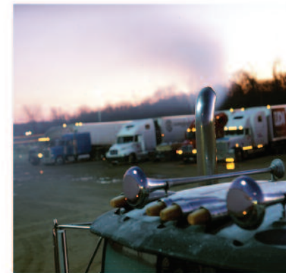
Webasto heaters eliminate unnecessary idling and reduce emissions, helping drivers conform to tougher idling regulations.

Webasto preheaters go to work before drivers arrive, heating the coolant in the engine and maintaining its temperature while in use. Webasto preheaters eliminate cold starts which cause wear and tear on truck engines.