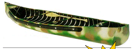
14' Sq. Stern