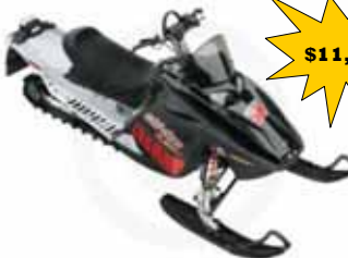
Summit Everest 146 800R Power T.E.K.