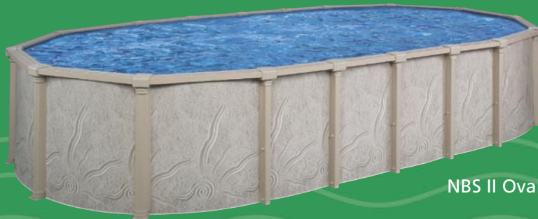
NBS II Oval