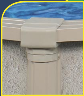
Form Fitting Support Cap

The 52" SOLEX pool is available in a variety of round and A-Brace or NBS II oval sizes to best suit your yard lay-out. The complete selection of liners are available in standard and optional expandable deep swimming area configurations.