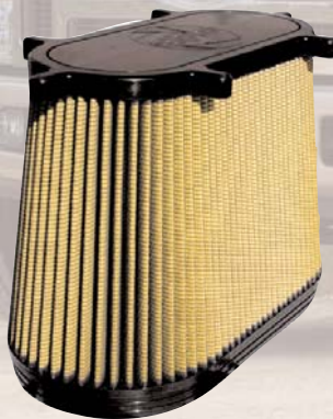
Pro-GUARD 7™ P/N 71-10107 for maximum protection

Unique design is easy to install and remove for cleaning.