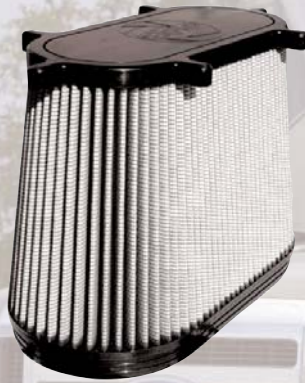
Pro Dry S™ P/N 11-10107 for maximum convenience

Unique design is easy to install and remove for cleaning.