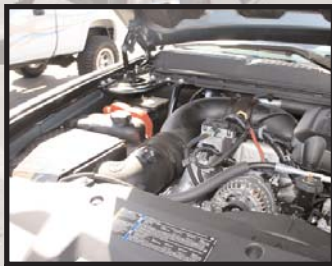
Installed P/N 75-11332

High performance 6" washable/reusable air filter for increased airflow and dust holding capacity. Also available with Pro-GUARD 7™ and Pro Dry S™ Technology.