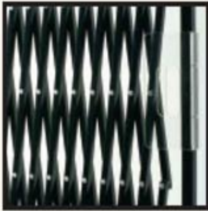
Black Scissor gate

A scissor gate and three styles of accordion gates are available.