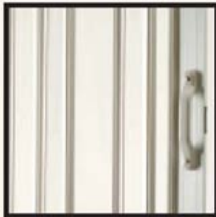
The Clearfold gate features a clear anodized frame with clear acrylic inserts