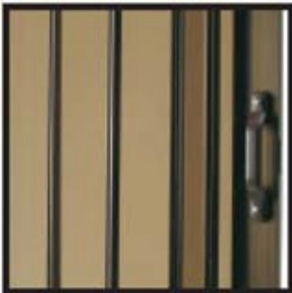
The Visifold gate features a bronze frame with bronze acrylic inserts