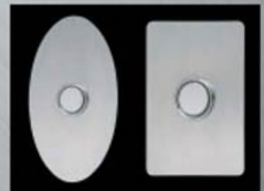
Stainless steel hall call buttons, oval or rectangular