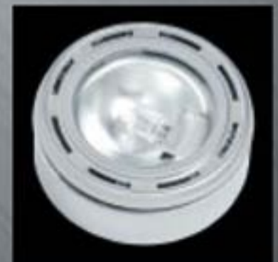
Recessed stainless steel down light