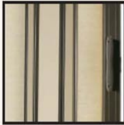
The Panelfold gate includes 3 clear acrylic inserts