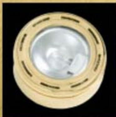
Recessed brass down light