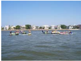
1st Annual ICW Run in 2006

Intracoastal waterway trip. The trip will take place the weekend of August 6th - August 9th, 2009. For those of you who have never been on a trip like this you are really in for a unique experience. We are proud to bring you this event and hope that everyone who attends will have a safe and memorable adventure. We will update our website frequently with more information, but if you have any questions please feel free to call or email us.