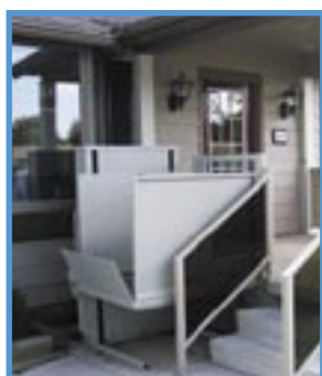
VERTICAL PLATFORM LIFTS