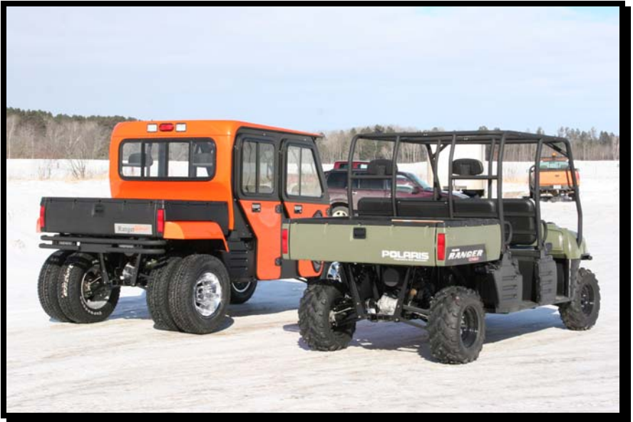
With And Without