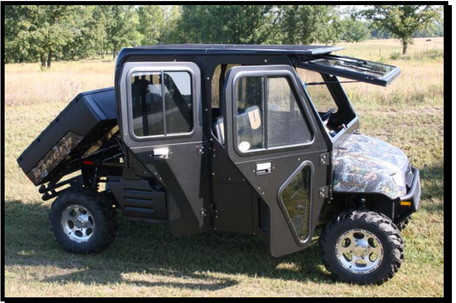
Camo Crew with Black Enclosure