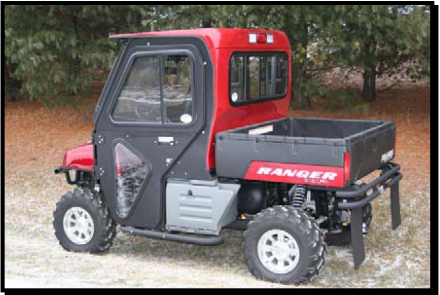
2008 & Older Models