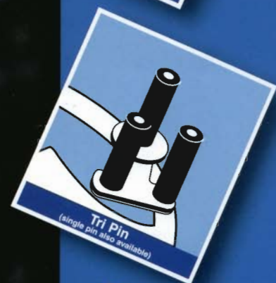
Tri Pin (single pin also available)