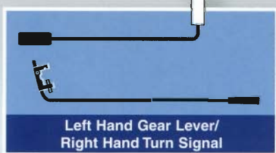
Left Hand Gear Lever/ Right Hand Turn Signal