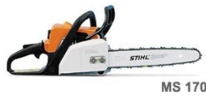
MS 170 Gas Chain Saw 30.1 cc/1.3kW

STIHL consumer saws are ideal for those occasional but nevertheless demanding jobs, combining the advanced technology, ergonomic design and safety features found in STIHL professional chain saws.