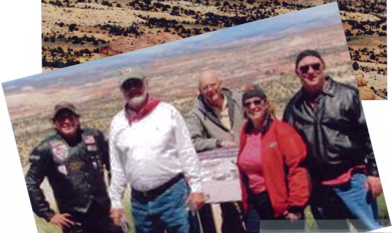
On Rt 12