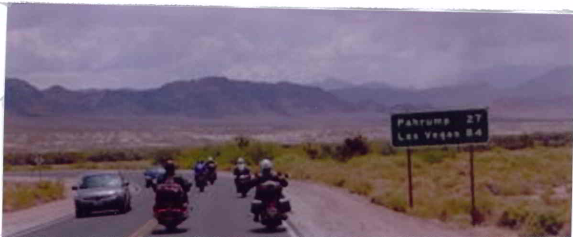
Heading into the clouds over Parump

The day started out sunny, but clouds were going to haunt us later in the day. After a gas stop in Shoshone, we aborted the ride up to Death Valley Junction, and rode back to Parump.