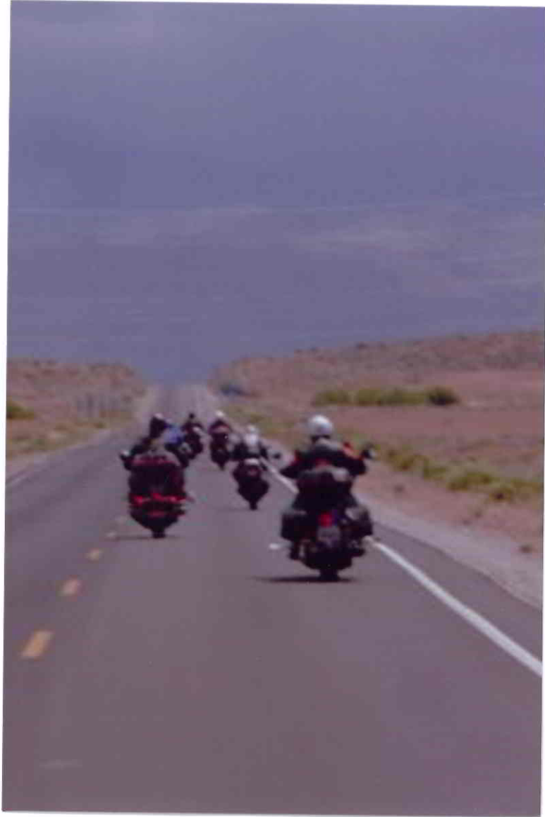
On the Open Road