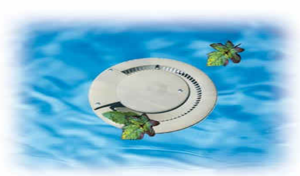
The MDX Debris Removal System drain