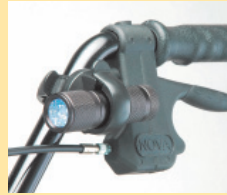
Item #FL-1000 Flashlight w/attachment