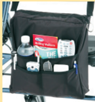
Item #4001WP Black Hanging Pouch