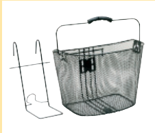
Item #TLC-B Basket