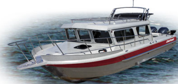
Boat may not be exactly as shown