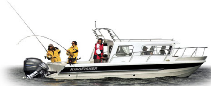
Boat may not be exactly as shown