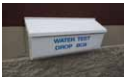
Located in Back of Store

If you can't make it into the store when we are open, just drop a sample by our box.