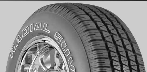
Tempra Radial SUV