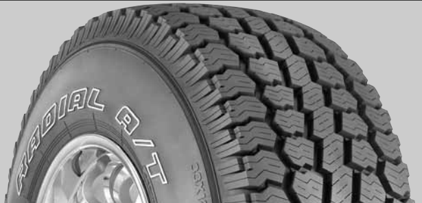
Trailcutter Radial A/T