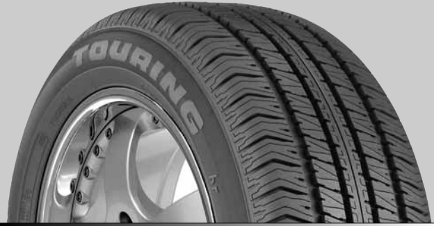
Tempra Touring vr/hr