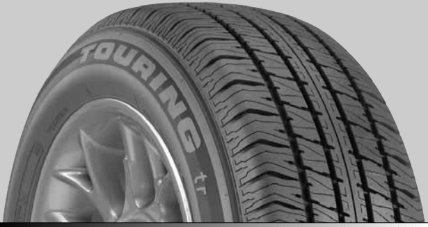
Tempra Touring tr