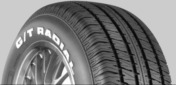
Tempra G/T Radial